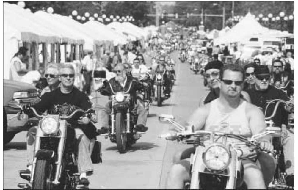
Hogs—of the two-wheeled variety—and their riders will join runners and walkers at the second annual Iowa Farm Bureau Hog Jog on June 7 in Des Moines to raise funds for agricultural education.

Motorcyclists will be competing for "Executive Choice" and "People's Choice" awards. Performance awards will be given by age in both male and female running categories. Each participant will receive a T-shirt, a National Pork Producers Council pin, entrance into the World Pork Expo and entrance into a drawing for various prizes. Live music and other contests are also part of the fun.